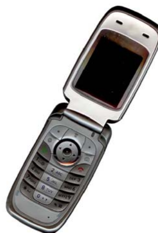
Figure 3. Example of an image with acceptable resolution