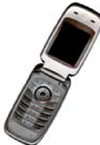
Figure 2. Example of an unacceptable low-resolution image

figure numbers must be placed after their associated figures, as shown in Figure 1.