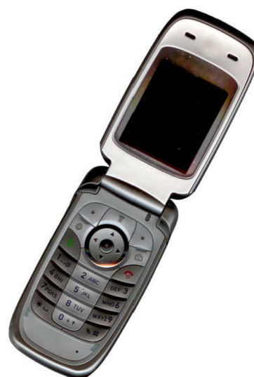
Figure 3. Example of an image with acceptable resolution