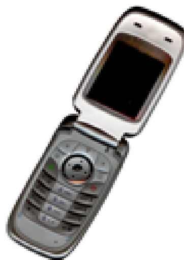
Figure 2. Example of an unacceptable low-resolution image

Figures must be numbered using Arabic numerals. Figure captions must be in 8 pt Regular font. Captions of a single line (e.g. Figure 2) must be centered whereas multi-line captions must be justified (e.g. Figure 1). Captions with figure numbers must be placed after their associated figures, as shown in Figure 1.