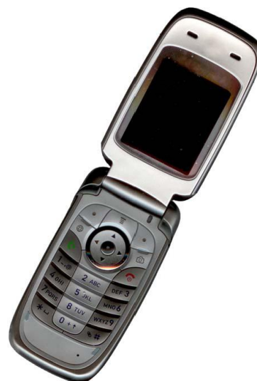
Figure 3. Example of an image with acceptable resolution